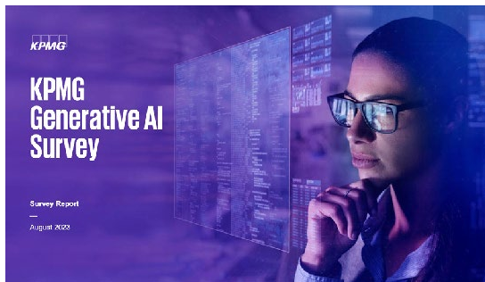
KPMG Generative AI Survey