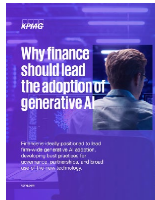
Why finance should lead the adoption of generative AI