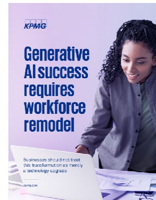
Generative AI success requires workforce remodel

Some or all of the services described herein may not be permissible for KPMG audit clients and their affiliates or related entities.